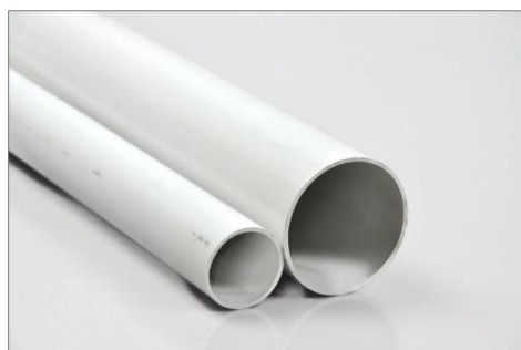
Fig. 1 RLHF and RSHF - white pipe