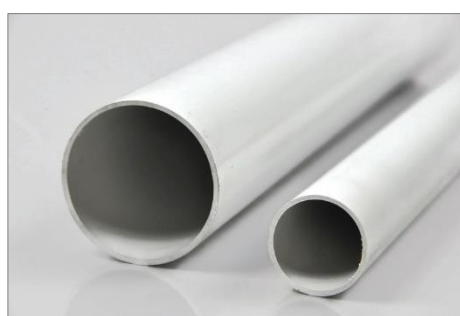
Fig.2 RSHF white