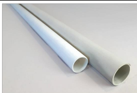
Fig.4 RLHF pipes - white and grey